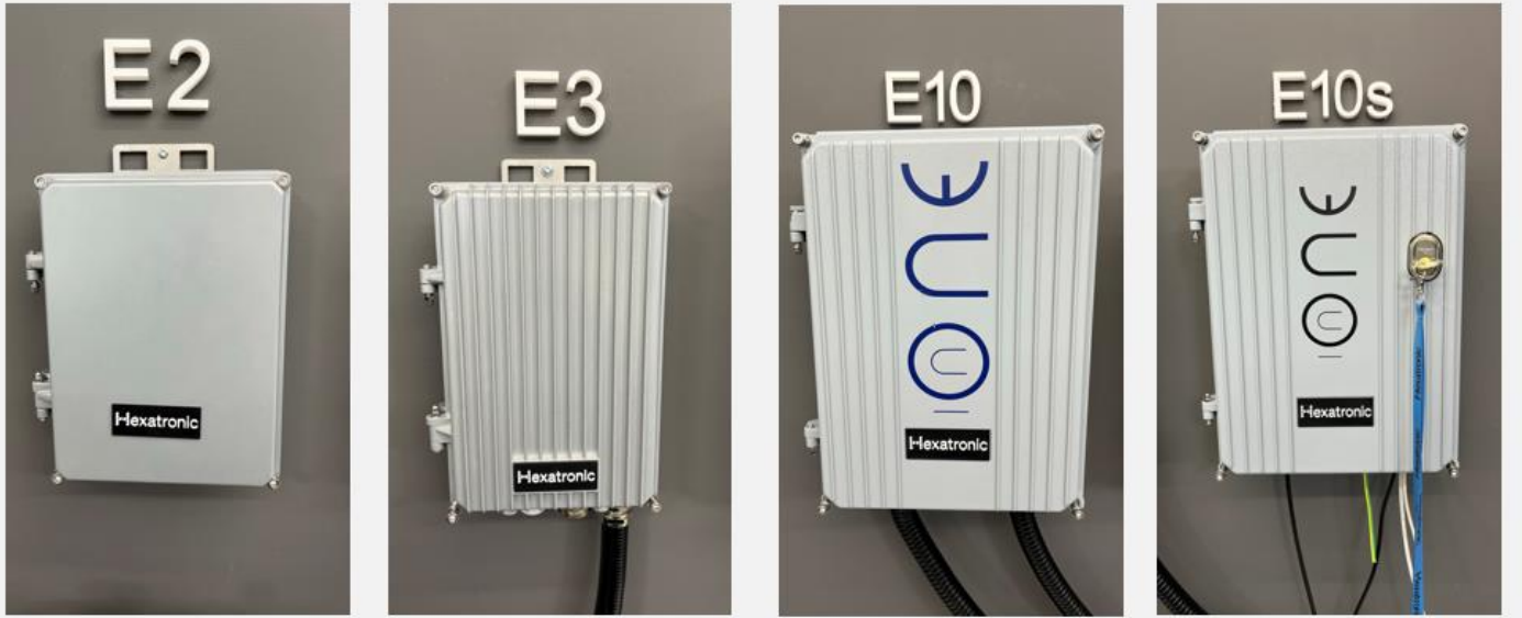
InOne HAN lineup