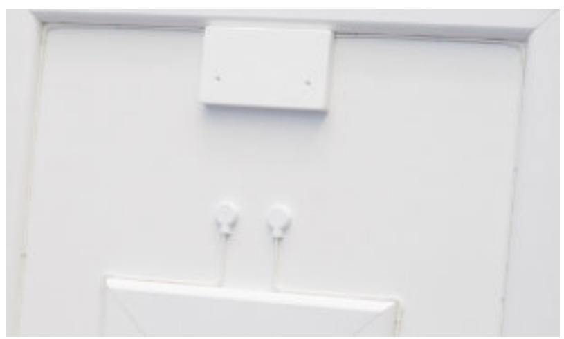
Cable Management Accessories Hexatronic MDU FTTH Lead In Glue Adhesive Clear Bend Radius Cable Retainers Discreet Fibre Optic