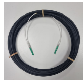
Cable - Simplex 1F